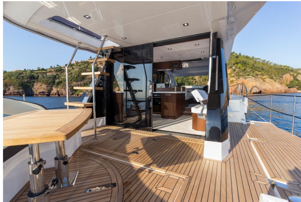
— Incredible cockpit area with the balconies down