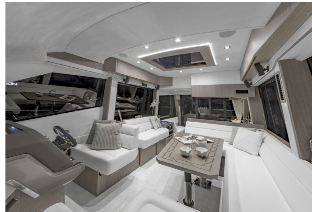
Dining and entertainment area with a pop-up TV —