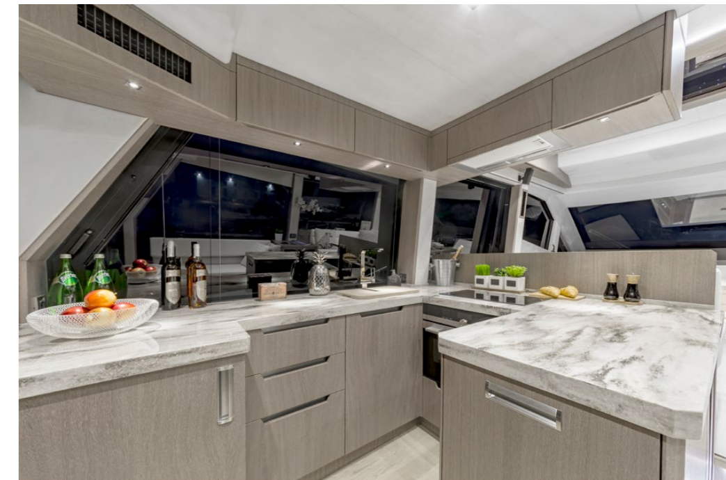
The kitchen comes fully equipped and can serve the outside bar —