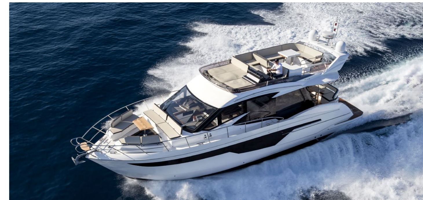
A large flybridge will fit all guests in comfort —