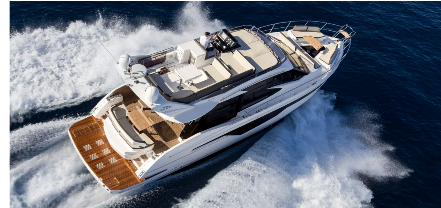
The roto-seat option allows the cockpit seating to face any direction —

Beach Mode extends the beam to six meters - serve refreshments at the bar