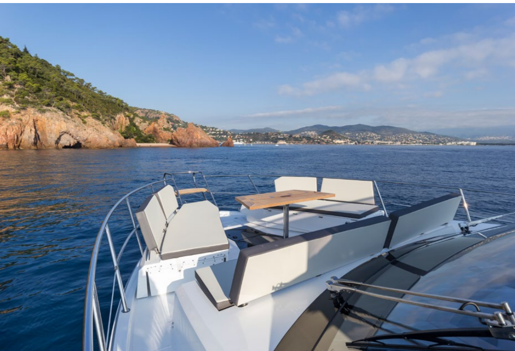
— Quickly drop the back rests and stow away the table for cruising