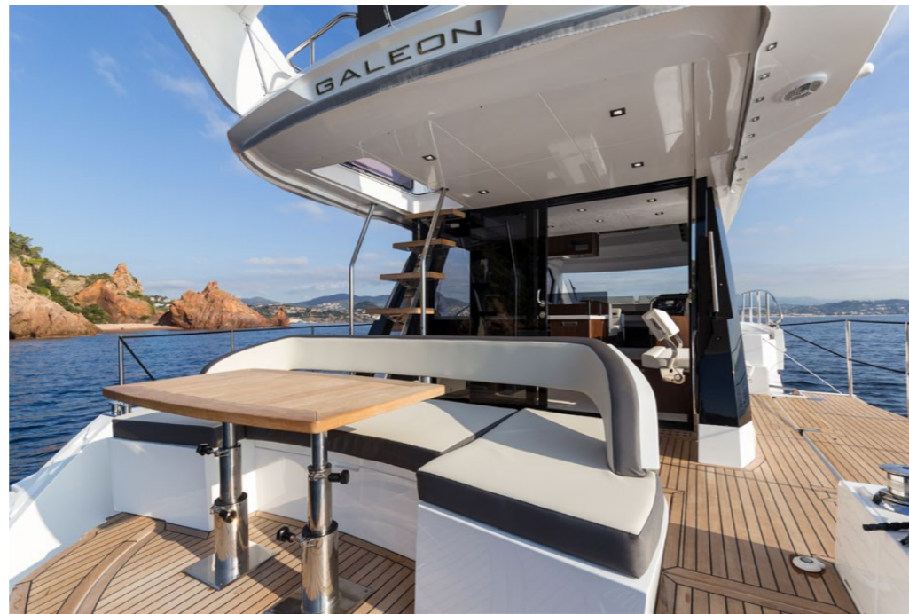
— The seat rotates 360°