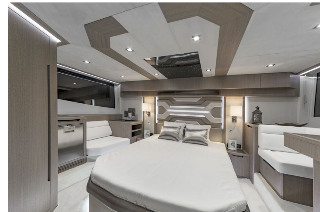
Master stateroom with en suite bathroom and rest area —