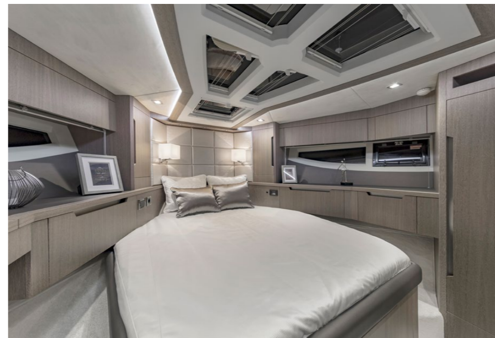
The bright VIP cabin offers ample storage —