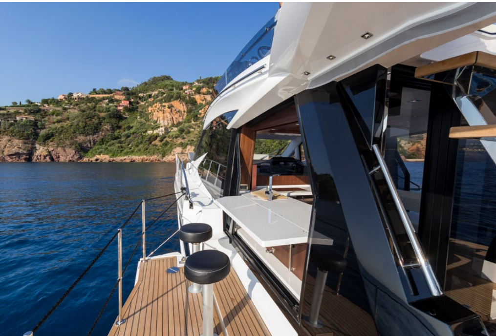
— Serve refreshments to the outside bar to impress the guests